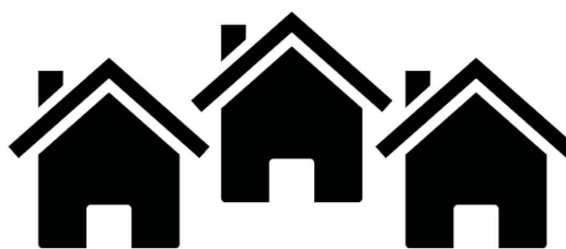
Collection of 3 cottages